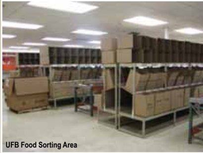
UFB Food Sorting Area