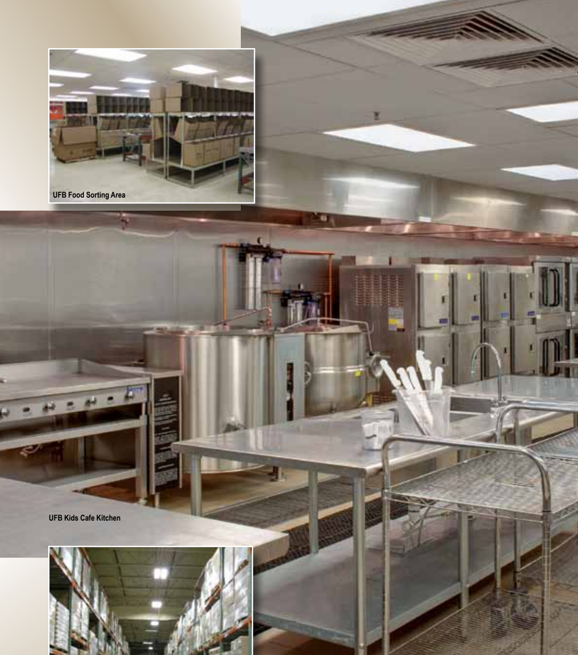
UFB Kids Cafe Kitchen