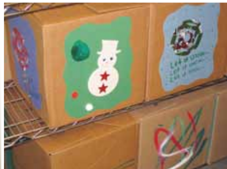
Decorated Senior Food Boxes

The Services for Seniors staff includes outreach specialists who assess the seniors' eligibility and need. The handymen provide friendly, free home repairs. Volunteers assist with food box delivery, yard work and snow removal.