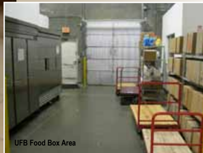
UFB Food Box Area