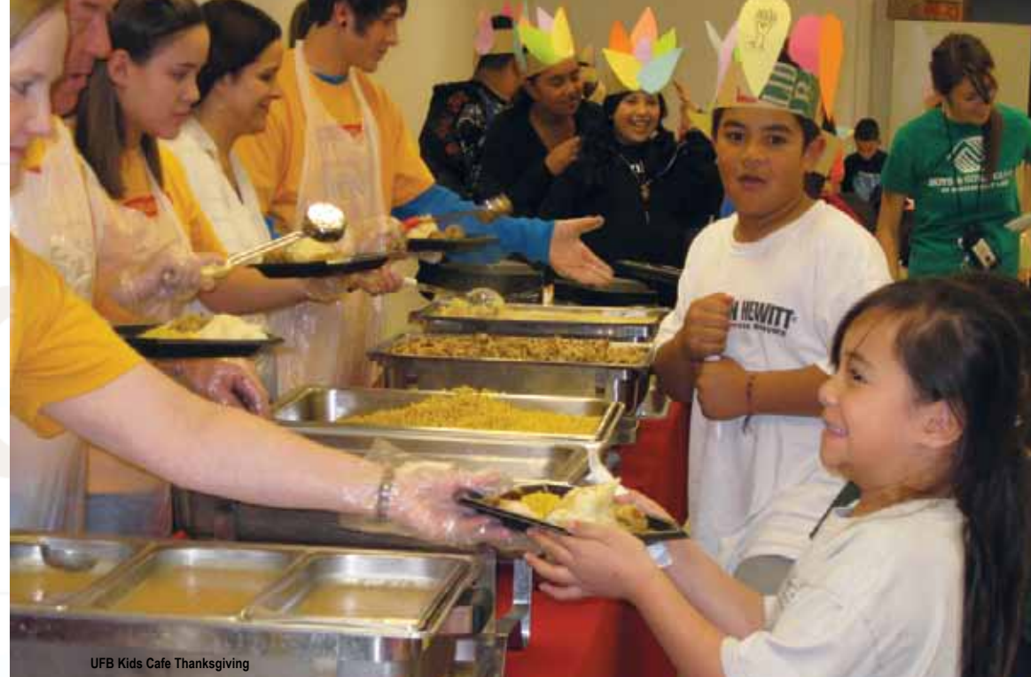
UFB Kids Cafe Thanksgiving

This list reflects contributions made from April 1, 2008-June 30, 2009.