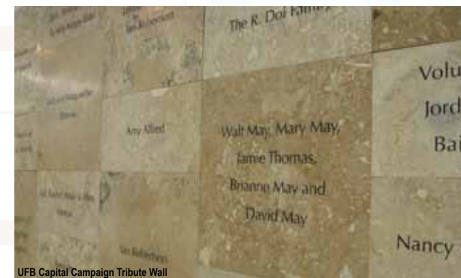
UFB Capital Campaign Tribute Wall