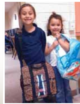
Kids Cafe, Backpack site.

Two annual sponsored events have been established to celebrate Kids Cafe. The first, Kids Cafe Carnival – kids are treated to a BBQ lunch, popcorn and other festive treats. Activities include an inflatable jump house, slides, games, face-painting, an exotic reptile petting area and more. The second, Kids Cafe Thanksgiving – kids are treated to a turkey dinner with trimmings. Unique table decorations are crafted by the children to celebrate the coming of the holidays.